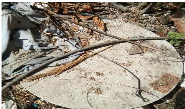
Figure 2: Containment system (HHs Survey 2019).

Mostly, the population of Bhaktapur Municipality are dependent on sewer system (T1A1C1, 91%), followed by fully lined tanks (T1A3C1, 1% and T1A3C10, 4%), user interface directly connected to open drain (T1A1C6, 3%) and lined tanks with impermeable walls and open bottom (T1A4C10, 1%). As per the household survey (2019), the average volume of containments in Bhaktapur Municipality is 12 m 3 .