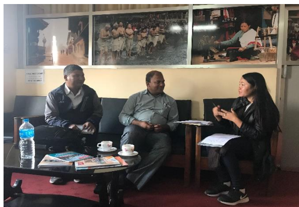
Figure 3: KII with Municipal staffs of Bhaktapur Municipality.

Since there is no standard design guidelines for the construction of containments in Bhaktapur municipality, the desludging frequency is not uniform for even the same type of containment (KII1, 2019). As per the household survey (2019), both manual (50%) and mechanical emptying (50%) were found prevalent in the municipality. The manually emptied faecal sludge is disposed by the household members and labours in the household premises while the mechanically emptied faecal sludge is transported by the private desludging vehicle, a tank equipped with movable centrifugal pump on a truck (KII2, 2019). The wastewater and supernatant are transported through the sewer system.