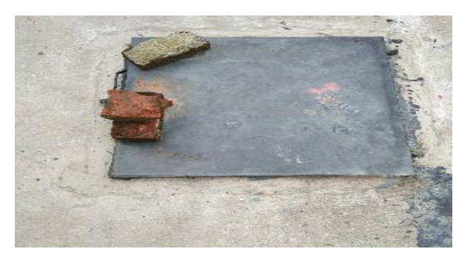
Figure 2: Containment system with manhole cover (HHs Survey, 2019).

Combined sewers are predominantly found in Madhyapur Thimi Municipality (T1A1C1, 90%), followed by lined tanks with impermeable walls and open bottom (T2A4C1, 1%; T1A4C9, 2% and T2A4C10, 4%), lined pits with semipermeable walls and open bottom with no outlet (T2A5C10, 2%) and fully lined tanks with no outlet or overflow (T1A3C10, 1%). As per the household survey (2019), the average size of the containment in Madhyapur Thimi Municipality is 7m<sup>3</sup>.