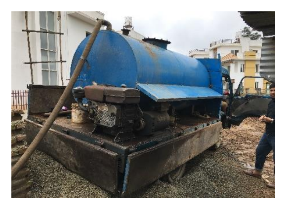
Figure 3: Desludging vehicle; a tank equipped with movable centrifugal pump on a truck.

The mechanically emptied faecal sludge is transported by the desludging vehicle, a tank equipped with movable centrifugal pump on a truck as shown in Figure 3. Wastewater and supernatant are transported through sewer system in Madhyapur Thimi Municipality.