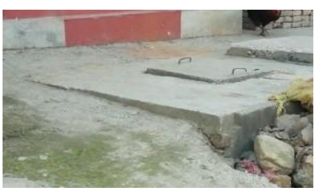
Figure 2: Containment system with manhole cover (HHs survey, 2019)

As presented in Table 1, 41% of the population are dependent on the sewer system (T1A1C1) followed by people using lined tanks with impermeable walls and open bottom (T2A4C10, 26%; T1A4C9, 6% and T1A4C8, 4%) and fully lined tanks (T1A3C10, 20% and T1A3C9, 6%). As per the household survey (2019), the average size of the containment is 7m<sup>3</sup>.